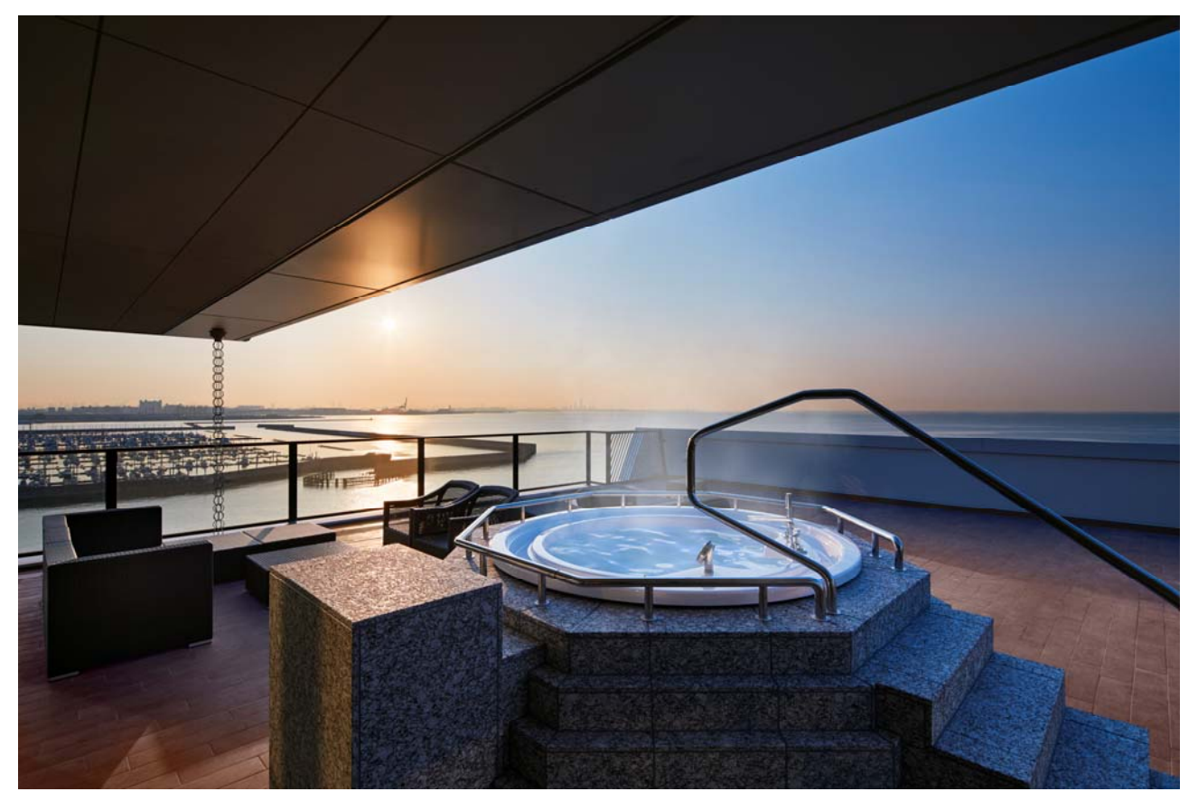
Premium Room (balcony)