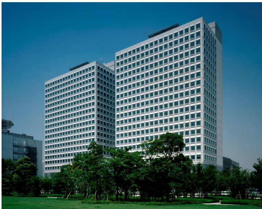
TOC Ariake exterior

Location: TOC Ariake East Tower 5F, 3-5-7 Ariake, Koto-ku, Tokyo Total floor area: 1,188.60 m 2 Planned equipment: CT scanner, mammogram machine, ultrasound examination equipment, endoscopy examination equipment Contracted operating medical institution: Midtown Clinic Medical Corporation Open: Fall 2015 (planned)