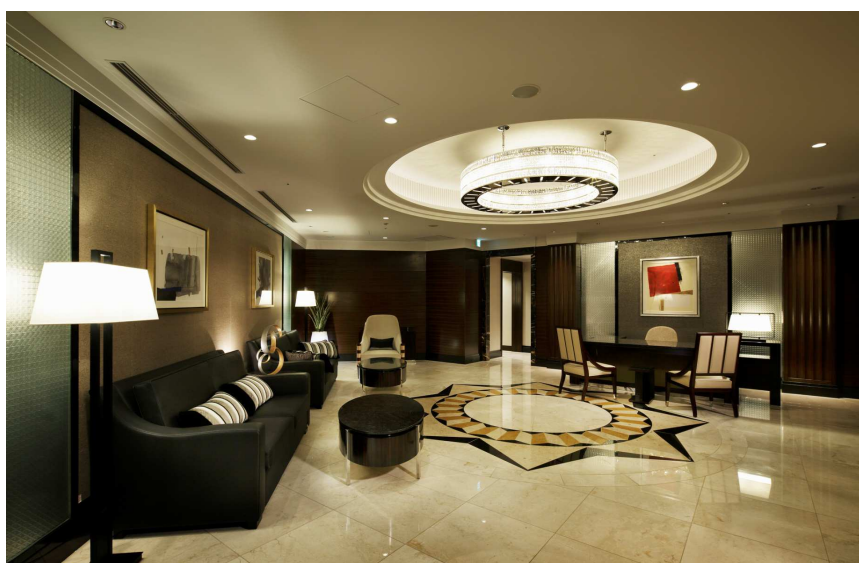
HIMEDIC Tokyo Bay Imaging Center lobby

Location: HOTEL TRUSTY TOKYO BAYSIDE B1F, 3-1-15 Koto-ku, Ariake, Tokyo Total floor area: Approximately 500m 2 Equipment: PET/MRI scanner, breast PET scanner, ultrasound examination equipment Open: April 27, 2015