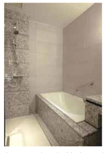
Standard Double Room